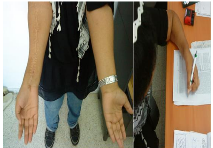
Figure 6: Clinical functional outcome four months after the last surgery.

The patient received three additional rounds of postoperative chemotherapy identical to the first three rounds, for a total of six treatments. Five years postoperatively, the patient had no signs of local recurrence or metastasis. Functionally, the results were satisfactory with good articular amplitudes, and the patient maintains a normal family and school life. (figure 6).