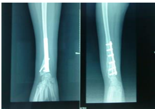
Figure 5: post-operative control after ulnarisation of the RADIUS.

The definitive anatomopathological study of the operative part confirmed the diagnosis of osteosarcoma with good tumor response to chemotherapy, including an 80% tumor necrosis rate.