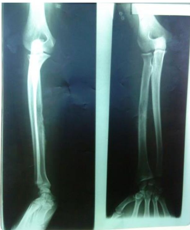
Figure 1: X-ray of the forearm showing a lacunar image of the RADIUS.

Standard radiography of her forearm showed a lacunary osteolytic image in the middle third of the right radius (figure 1). An MRI was performed as a part of the locoregional assessment, which showed a lacunary image measuring 4 cm x 2 cm with no involvement of the soft tissue. We noted the neurovascular pedicle. (figure 2)