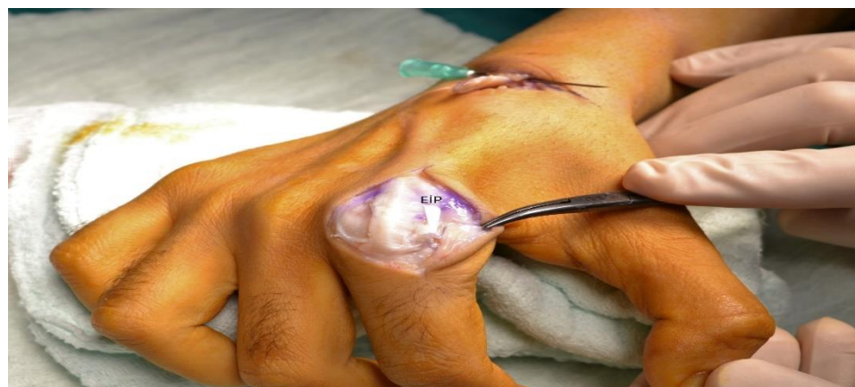
Figure 6 : The EIP tendon transferred to the 1st interosseous. (PN: 3)