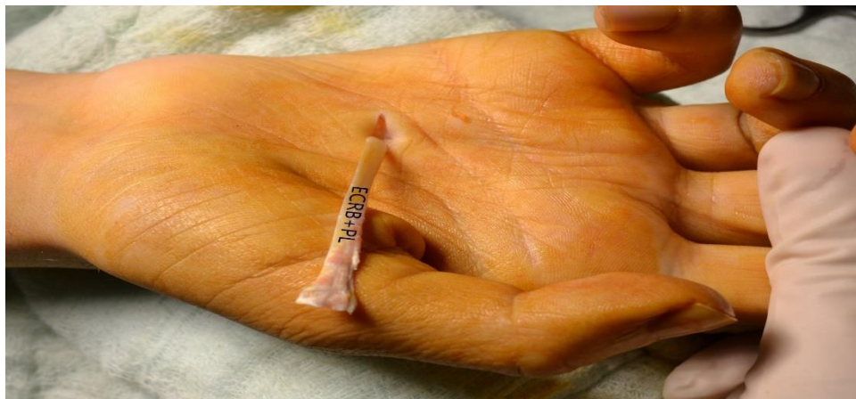
Figure 4 : for thumb adductorplasty, the ECRB tendon is passed through the intermetacarpal space between the third and fourth metacarpals (PN: 8)