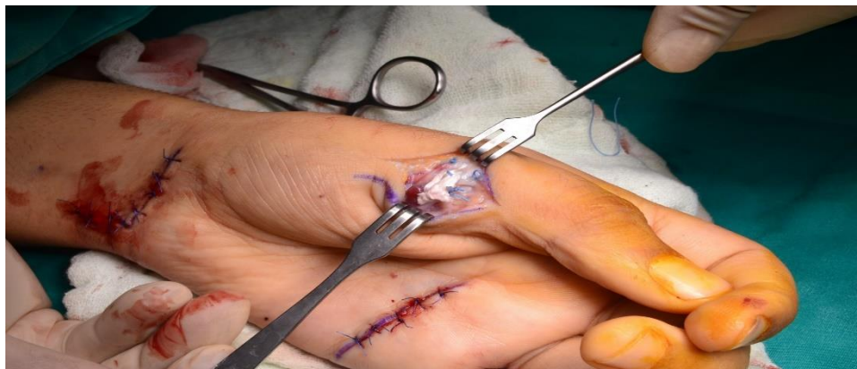
Figure 5 : The ECRB tenodesis at 1st metacarp adductor tubercle. (PN: 6)