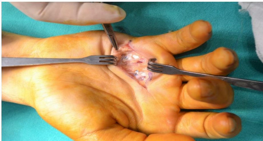
Figure 1: The FDS-4 and FDS-5 tendon used for the claw hand were underwent tenodesis on A1 pulley. (PN:14)

Patient number (PN), Age(A), gender(G), male(M), female(F), high(H), low(L), extensor carpi radialis brevis(ECRB), PL tendon was used for autograft(*), extensor indicis proprius(EİP), brachioradialis(BR), extensor digiti minimi(EDM), extensor digitorum communis(EDC).