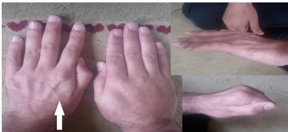
Figure 7: Postop figures of patient who has no claw hand, no Wartenberg sign and no Froment sign. (White arrow: affected side) (PN: 2)

No claw hand deformity was found in any of our patients, except the patient who was injured with a gunshot. The Zancolli lasso procedure was underwent to this patient who had the worst adherence to postoperative rehabilitation. One of these patients had flexion contracture in the 5 th finger PIP joint. The Wartenberg sign and swan neck deformity were not found in any of the patients at their last examination (Figure 7,8).