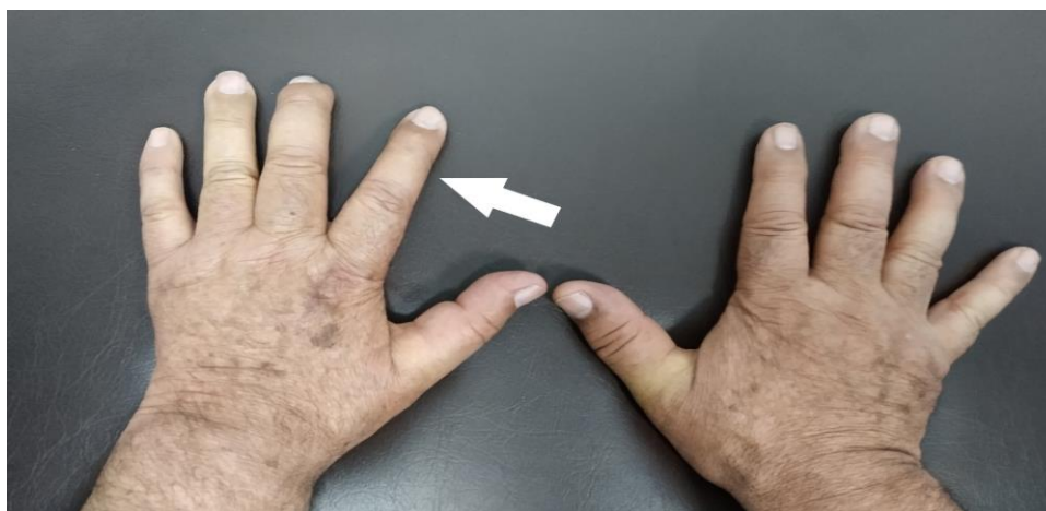
Figure 9: Postop figure of patients who has hiperabduction of index finger. (White arrow: affected side and hiperabduction of finger) (PN: 5)

The strong grip measurement was evaluated as %62.7 (max: 85 min: 22) on average compared to the opposite hand. Postop Quick-DASH mean scores of the patients were evaluated as 36.8 (max: 45 min: 9.5). Postop Key-Pinch test mean scores of the patients were evaluated as % 63.4 (max: 90 min: 33) on average compared to the opposite hand (Table 2). Two of the patients who underwent the first interosseous transfer using only the EIP tendon had hyperabduction in the second finger (Figure 9.). All of our patients had surgical scarring, it was remarkable because the hands had atrophy and they were not satisfied with this situation. Satisfied, moderately satisfied and dissatisfied were asked three parameters in the satisfaction evaluation of the patients. Seven (%50) of the patients were satisfied, 5 (%36) patients were moderately satisfied and two (%14) patients were not.