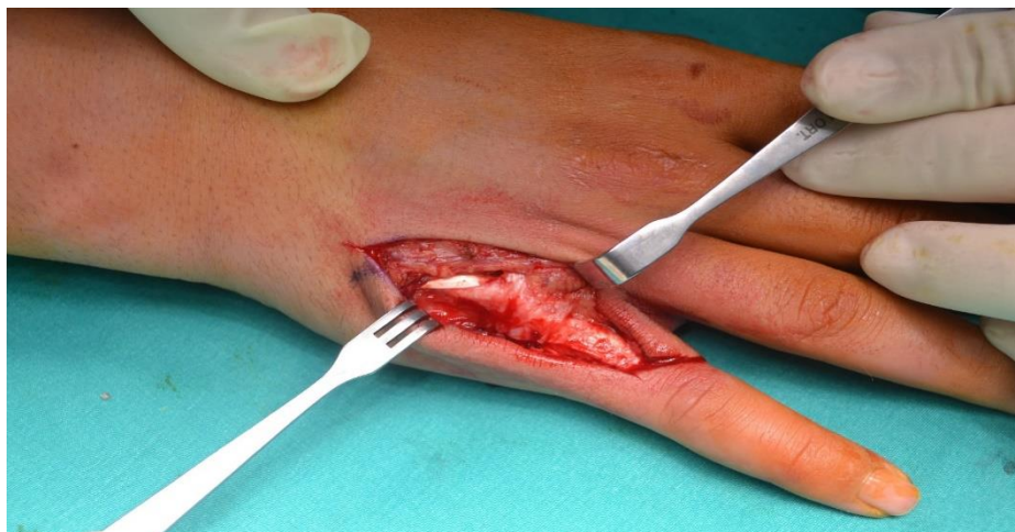
Figure 2: The EDM tendon transfer to A2 Pulley for small finger abduction and MCP flexion. (PN: 6)