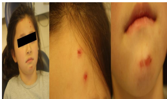
Fig. 1: Extraoral view of the patient

9-year-old girl admitted to the clinic with the complaint of gingival recessions showed marked skin picking on the left side of the face and tip of the chin (fig.1) and irritation due to trauma in the area of the right first deciduous molar and deciduous canine in the lower jaw (fig.2). It was determined that the child lost his mother about 6 months ago, and therefore hurt herself. Fluor varnish (MI Varnish, GC Corp., Japan) was applied to the relevant teeth and the child was directed to the child psychiatric service. When the patient came for control 6 months after the psychiatric treatment, it was observed that the surrounding tissues where the habit was abandoned started to heal (Fig.3).