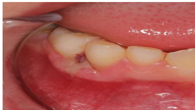
Fig. 2: Intraoral view of the patient