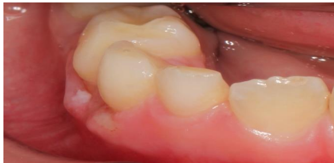
Fig. 3: View after 6 months