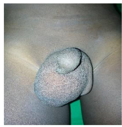
Figure 2: Right inguino-scrotal hernia by persistence of the peritoneal-vaginal canal

patients were painless inguinal swelling in 86.30% of cases, followed by painful inguinal swelling in 13.70% of cases Figure 2.