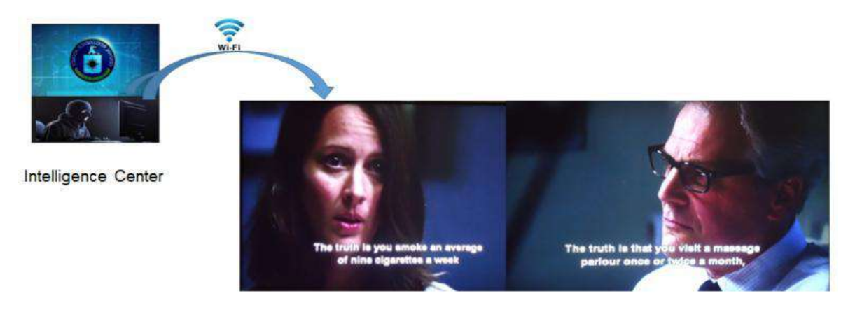
Fig 9: The secret of Ruth :The cerebral internet

For Catholics, God sees everything, and guides his actions, cerebral internet performs an action that can simulate God. Cerebral internet accompanies and watches all our daily activity, it simulates the voice of the unconscious, and for this reason cerebral internet has been used as a weapon of war, taking advantage of the faith. Cerebral internet was successfully used by US army in the Gulf War, it was named as "the voice of God".<sup>(16)</sup> This is the reason why the press subliminally promotes the cerebral internet as God, in editorial cartoons and newspaper articles. The main subliminal promotion about cerebral internet as God, is related to Google<sup>(58,59)</sup>. The reason of this promotion is a secret of the world press: Google is secretly developing the cerebral internet with Google brain chip in the world. (Fig9).