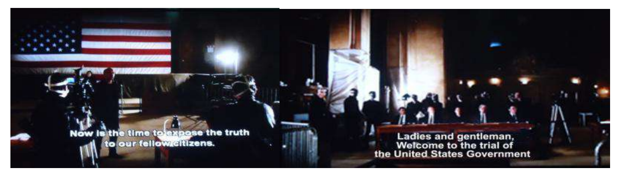
Fig 10: The "Popular Trial" to United States Government by mass surveillance

Vigilance, a terrorist group that defends privacy, kidnaps government representatives to carry out a clandestine trial. Actually, US Government should be legally prosecuted by mass surveillance by internet cerebral in the world.