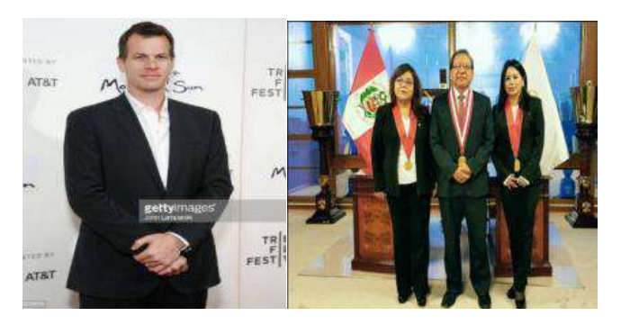
Fig 13: Mafias of prosecutors in Latin America: