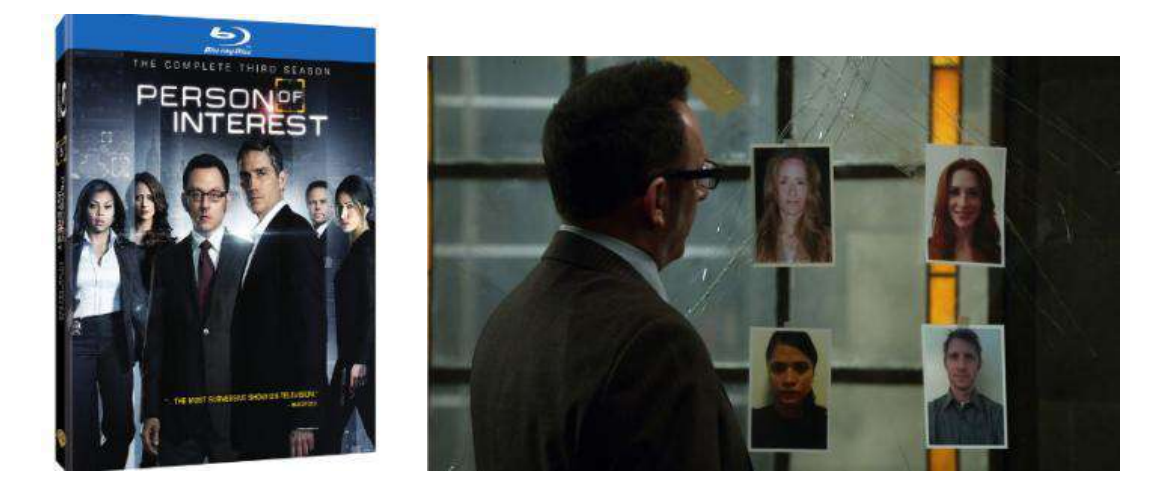
Fig 1: Person of interest: The promotion