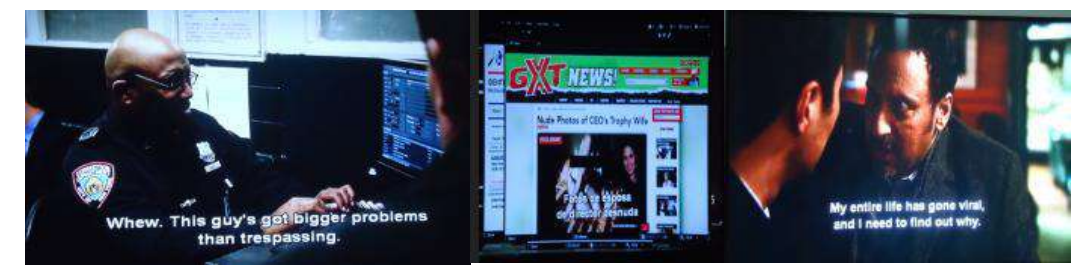
Fig 12: Individualized Terrorism :