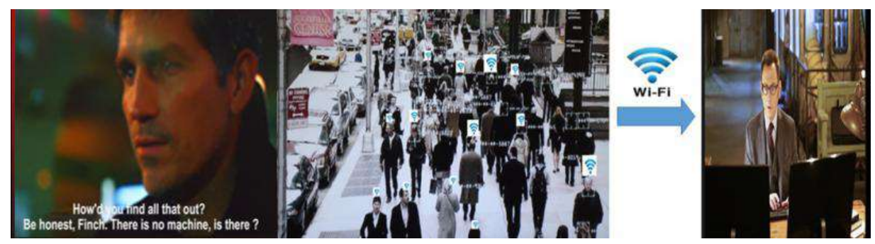
Fig 3: The secret of "Person of interest":The Cerebral Internet

Actually, the secret of the "Person of interest" is that it recreates a city with citizens who secretly have brain nanobots or microchips, they are spied on without their consent with cerebral internet. (Fig 3)