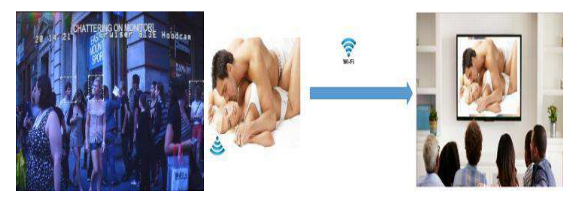
Fig 6: Cerebral internet's main goal: The sex life of young women, nor her security

In the real life, "Person of interest", is a chosen citizen by the mafias of the cerebral internet because can benefit to the government mafias, thus a Person of interest can be a Miss universe, a millionaire, a lawyer, a eminent scientist, or an enemy to the interests of the government mafias such as honest judges.(Fig6)