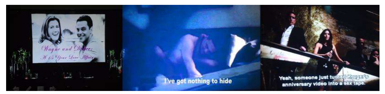
Fig 11: The Biography: A weapon to destroy the honor

-"<u>The biography</u>" is recreated_in the chapter"Nothing to hide", it is a "documentary" based on videos of the victim's private life obtained with the cerebral internet in order to destroy his honor. (Fig 11) Actually,