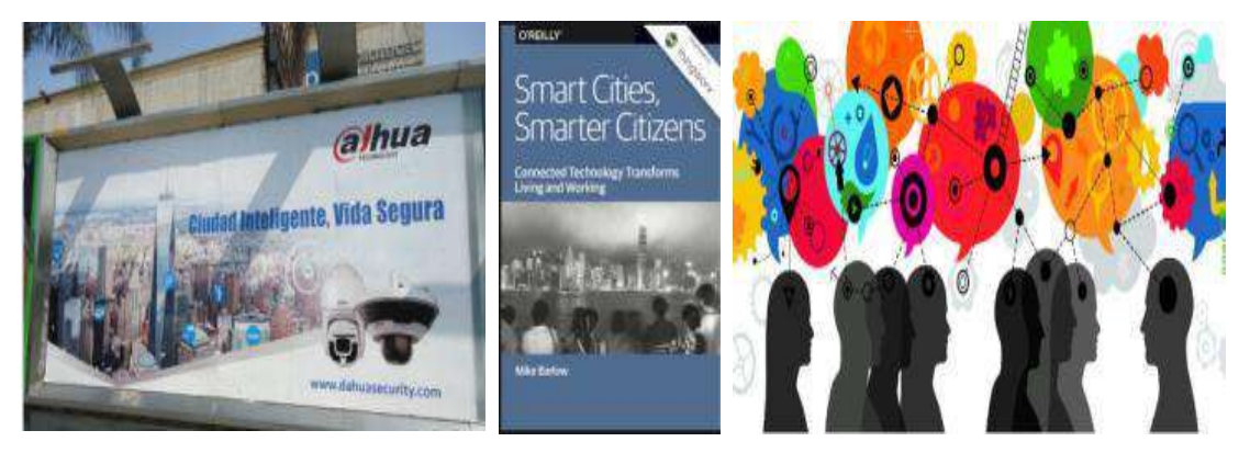
Fig 4: The Big Fraud:Smart city and Smart Citizen

Smart city is an urban area that uses different types of electronic data collection sensors to supply information which is used to manage assets and resources efficiently. The city of New York has been announced as the Best Smart City of 2016 as part of the World Smart City Awards<sup>(20)</sup>. The development of Smart cities has a main component: The creation of Smart Citizen<sup>(21,22)</sup>, the Citizen with brain microchips. In fact, the Smart City campaign is another intellectual camouflage to develop the societies of citizens spied on with the cerebral Internet. (Fig 4 y 5)Promotion of Smart Citizen is associated to iconography of robotization, this fact reinforces this suspect: Smart Citizen will be spied on with cerebral internet and subjected to a process of human robotization.<sup>(23)</sup>