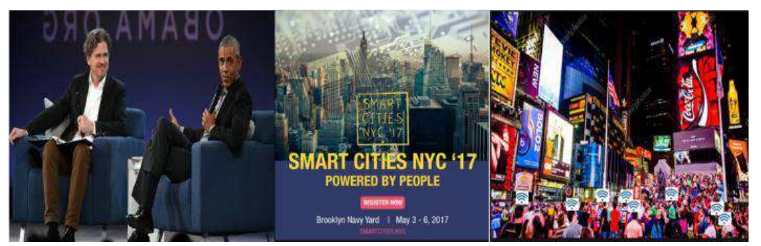
Fig 5: NewYork: A city spied on with the cerebral internet

-The secret script of "Person of interest"-